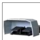
PS.2 Double foot pedal