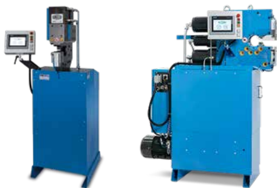
HMC 1-25 | HMC 1-30