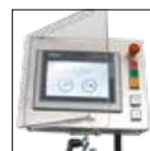
807.2 Screen protector