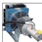
OC HM 3xx/HM 245