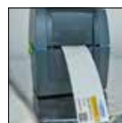
ULS UNIFLEX label system