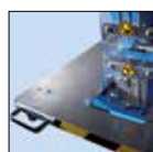
Sliding table with handle