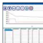
UTS/UDL Data transfer