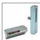
PTS Die marking