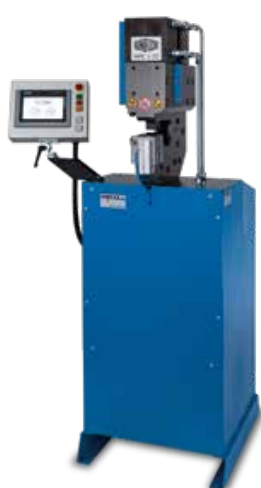
HMC 1-25 | HMC 1-30

Press designed specifically for the production of automotive hoses. A good example for such a tailor-made solution is the HMC 1-25, HMC 1-30 and HM 245 with C-shaped crimping tool designed for radial insertion of complex hose lines. This special press is an ergonomically designed, low-noise machine that requires no lubrication. It has been specifically devised for the production of hoses for the automotive industry, offering outstanding press forces and precision. With PFC and other optional features, you can adjust the press force to process materials that are easily damaged, producing strong and lasting connections without any need for gluing, screwing or welding.